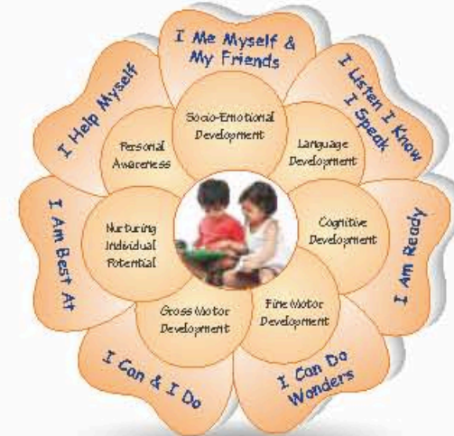
Seven Petals Approach

LITTLE Millennium follows the Seven Petals Approach to learning where every day is a joyful learning experience.