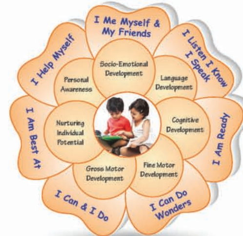
Seven Petals Approach

LITTLE Millennium follows the Seven Petals Approach to learning where every day is a joyful learning experience.