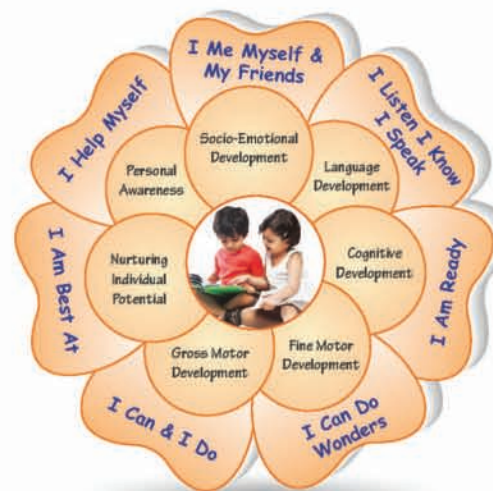
Seven Petals Approach

LITTLE Millennium follows the Seven Petals Approach to learning where every day is a joyful learning experience.